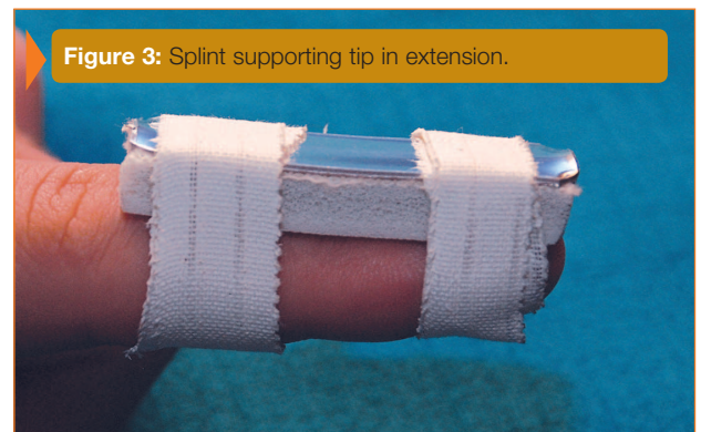
Figure 3: Splint supporting tip in extension.