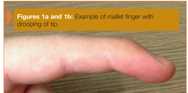
Figures 1a and 1b: Example of mallet finger with drooping of tip.

In children, mallet finger injuries may involve the cartilage that controls bone growth. The doctor must carefully evaluate and treat this injury in children so that the finger does not become stunted or deformed.